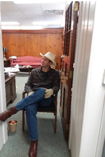
Trick or Treat Fun