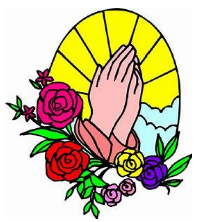
Prayers for Health and Other Concerns:

I will light candles this Christmas, Candles of joy despite all the sadness, Candles of hope where despair keeps watch, Candles of courage for fears ever present, Candles of peace for tempest-tossed days, Candles of grace to ease heavy burdens, Candles of love to inspire all my living, Candles that will burn all year long.