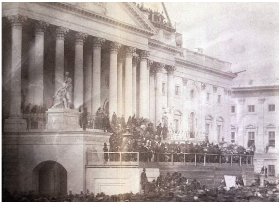
The Inauguration of President James Buchanan, March 4, 1857. The earliest known photograph of a presidential inauguration.

January 20, 2020 | Waynesboro, Virginia | a newsletter supplement.