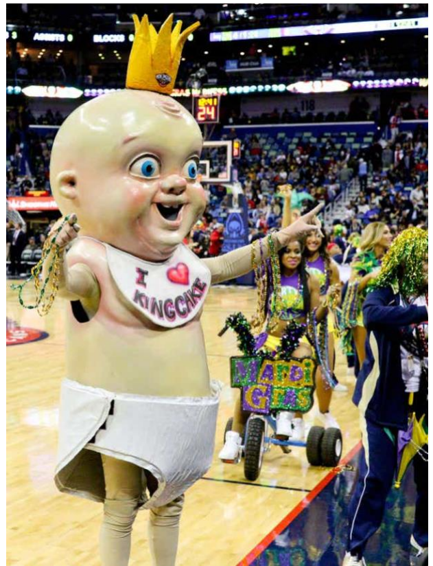
The New Orleans Pelicans use this frightening King Cake Baby mascot around the time of Mardi Gras, which only makes sense if you're from New Orleans.

Take a moment to consider how God's love and power are revealed to you this day, as we remember the gifts of Gold, Frankincense, and Myrrh.