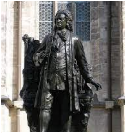
Statue of Bach outside Thomaskirche, Leipzig. Felix Mendelssohn raised the funds for the statue while he was director of the Leipzig Conservatory.

Sunday 21 March marks the 336 th anniversary of the birth of Johann Sebastian Bach (1685-1750). All of the music for Sunday's service was composed and arranged by the man often referred to by musicians as der Meister alle Meister (the Master of Masters). Bach spent the last half of his life as the Cantor for the Thomaskirche in Leipzig, Germany. In addition to directing the music program for the 'St. Thomas Church,' Bach also provided music for three other churches in Leipzig. And if that wasn't enough, he was also the town composer, responsible for providing music for various local celebrations! The two hymns for the fifth Sunday of Lent, Blessed Jesus (Liebster Jesu) and Out of the Depths (Aus tiefer Not) , were both harmonized by Bach. Choral singers often enjoy Bach's harmonization, as each part's interesting line can weave