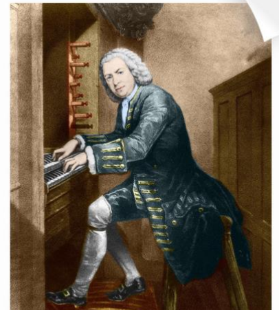
Johann Sebastian Bach playing the Organ, c.1881 (color lithograph), French School.

The prelude, special music and another all of one work, simply titled Pièce d'Orgue (Organ Piece) . What an understated title for a composition by the man known during his lifetime as one of the greatest organists of all time! (Bach was not known as a composer until years after his death, when composers like Felix Mendelssohn and Robert Schumann championed his music.) Bach used a French title to illuminate the French aspect of this three-part composition. The first section (this week's prelude) is marked Très vite (Very fast), with fleet passagework in the manuals. The second section (special music), Grave , exemplifies what the organ does so well, playing chord after chord on an infinite supply of air. The final section (postlude) is marked Lentement (slowly). However, Bach is referring to the harmony changing slowly, while the notes are as fleet as in the opening section.