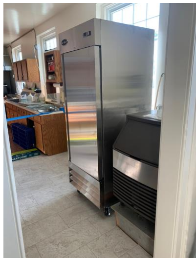
New refrigerator, flooring.

As we anticipate a return of fellowship events soon, renovations in the kitchen are nearing completion. Check out the new flooring and refrigerator (left); when the floor is completed, new prep tables will make it easier to navigate the workspace. Thanks to all who have worked on this project!