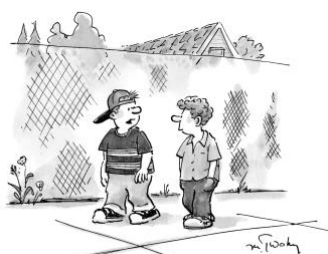
"For Father's Day, I'm giving my dad an hour of free tech support."

As we anticipate a return of fellowship events soon, renovations in the kitchen are nearing completion. Check out the new flooring and refrigerator (left); when the floor is completed, new prep tables will make it easier to navigate the workspace. Thanks to all who have worked on this project!