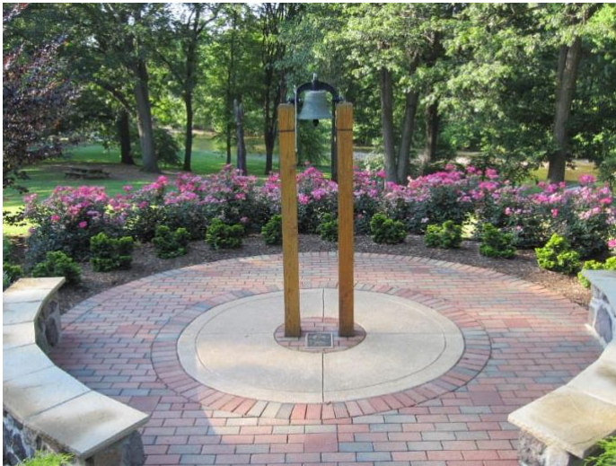
a cancer awareness garden in Waynesboro's Ridgeview Park.