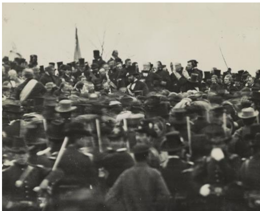
Abraham Lincoln gives Gettysburg Address November 19, 1863

As followers of the Prince of Peace, let us pray fervently for the protection and well-being of all of Ethiopia's people. Let us pray particularly that: