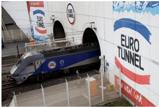
Channel Tunnel opens November 14, 1994