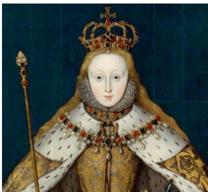
Elizabeth I crowned November 17, 1558