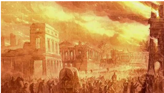
Union Armies under General Sherman burn Atlanta November 15, 1964