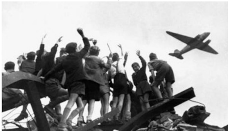
Soviet Russia blockades Berlin, prompting an emergency airlift to relieve isolated West Berliners. During the Berlin Airlift, American and British planes flew about 278,000 flights, delivering 2.3 million tons of food, coal and medical supplies.