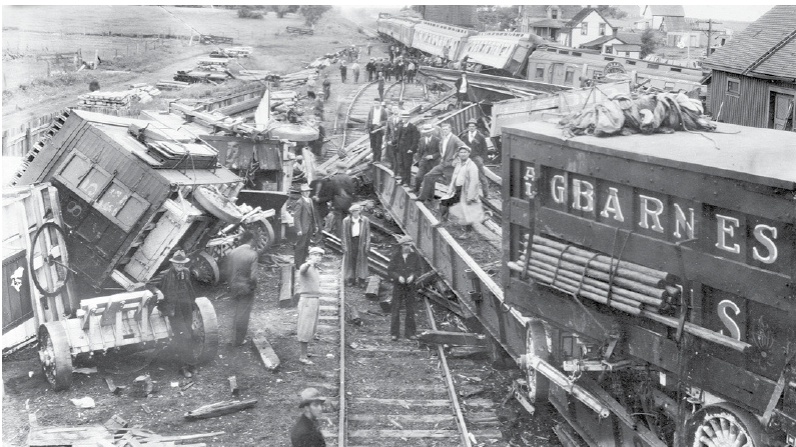
A Michigan Central troop train struck the rear of the Hagenbeck-Wallace Circus train in Ivanhoe, Indiana., killing fifty-three circus performers and numerous circus animals.