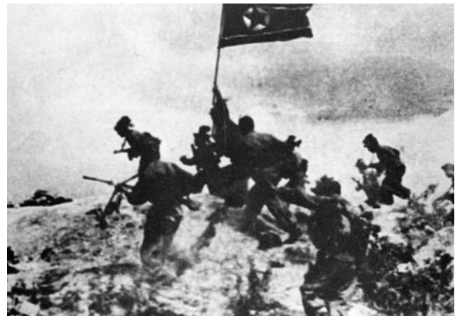
North Korean troops cross the 38th parallel and invade South Korea. UN force entered the conflict, which would end with an armistice three years later.