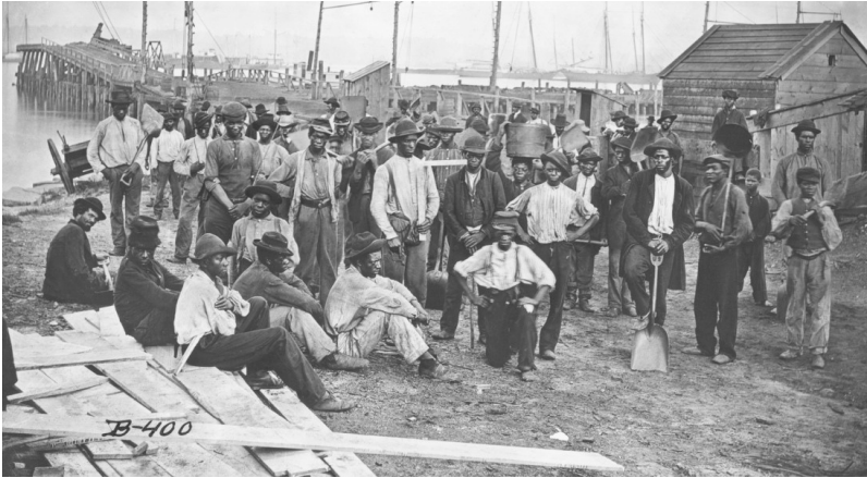
Union Major General Gordon Granger arrive in Galveston, TX and reads General Order No. 3, informing the people that all slaves were free , and there was an absolute equality of personal rights and rights of property between former masters and slaves . An estimated 250,000 enslaved African Americans in Texas were emancipated.