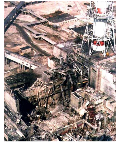
Explosion at Chernobyl causes catastrophic meltdown April 26, 1986