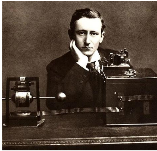
Wireless Telegraphy pioneer Guglielmo Marconi born in Bologna April 25, 1874