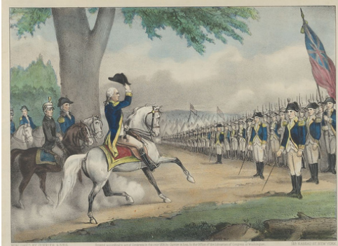
WASHINGTON TAKING COMMAND OF THE AMERICAN ARMY. At Cambridge, Mass. July 3 rd 1775.

George Washington takes command of the Continental Army. July 3, 1775