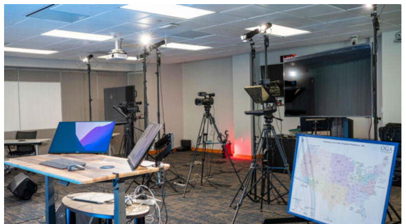
Studio setup for the virtual plenary sessions of General Assembly.

Fourteen plenary sessions will be held virtually beginning Tuesday, July 5 and completing Saturday, July 9. Commissioners will log in to vote and debate via Zoom while observers can view sessions on the livestream found at ga-pcusa.org .