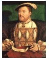
Pope Paul III excommunicates King Henry VIII after he declared himself supreme head of the Church in England. December 17, 1538