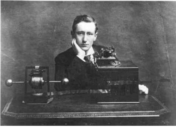
The first transatlantic radio signal was transmitted by Guglielmo Marconi from Cornwall, England to St. John's, Newfoundland. December 11, 1901