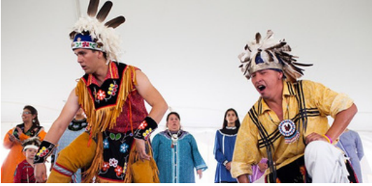
Members of the Seneca Nation.

This Sunday, we will sing the beloved hymn Lo, How a Rose e'er Blooming . The tune, known as "Est ist ein Ros entsprungen," was composed by an unknown author before the 17th century, and was first published in 1599. A decade later, German composer, organist and musical theorist Michael Praetorius (1571-1621) composed the now familiar harmonization.