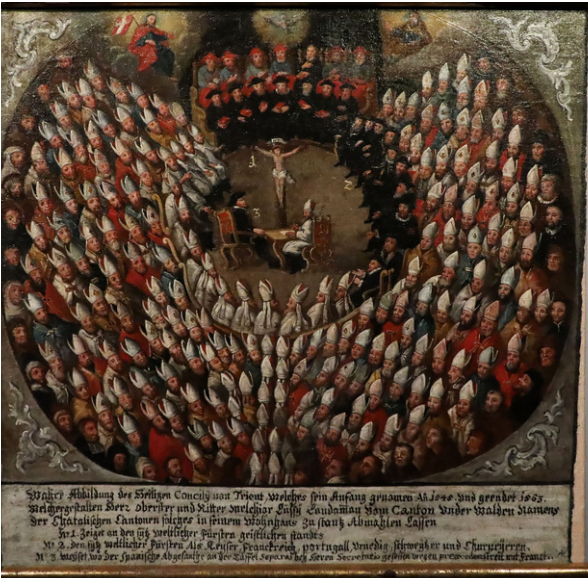
The Council of Trent is convened by Pope Paul III to address the rise of Protestantism, and institutional corruption within the Church. December 13, 1545