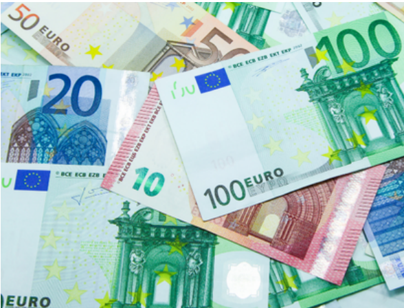
European Union leaders announced their new common currency would be known as the Euro . December 15, 1995