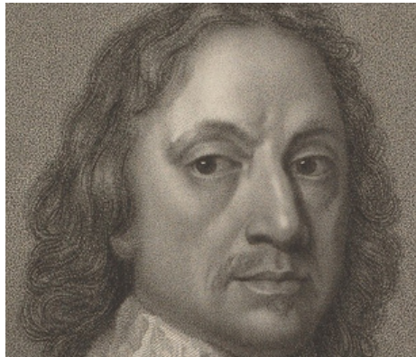
Oliver Cromwell is declared Lord Protector of England, following the defeat of King Charles I by Parliamentary forces in the English Civil War. December 16, 1653