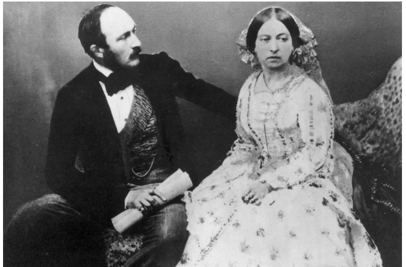
Prince Albert of Saxe-Coburg and Gotha, consort of Queen Victoria, dies of typhoid at Windsor Castle. The Queen was so devastated that she entered into a deep state of mourning, wearing black for the rest of her life December 14, 1861