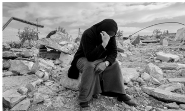
Woman sitting on the ruins of her house destroyed by Israel in (Masafer Yatta ) January 2023.

Louisville, KY (OGA) — As many as 10 Christian denominations and church-based organizations are urging President Joe Biden to actively seek peace between Palestinians and Israelis by ending military aid to the Israeli government. In a letter sent to the president over the weekend, the group described the deteriorating human rights situation and rise in violence in both the occupied Palestinian territory and Israel.