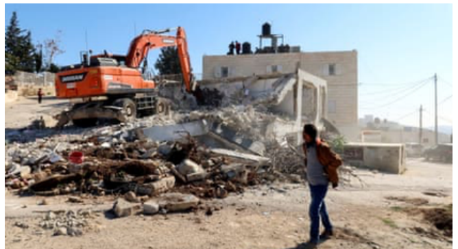
A Palestinian home being demolished in Ras al-Amud, East Jerusalem, 21 January 2023.

The letter says the new Israeli government is moving to “undermine the rule of law in Israel” and is directly threatening the rights of women, LGBTQ communities and Palestinians who are citizens of Israel, adding that the abuses and lack of accountability have resulted in decades of Palestinian suffering.