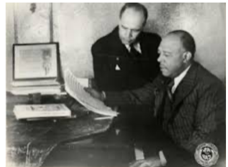
The Johnson brothers.

The Introit, Lift Every Voice and Sing , was composed by two brothers. James Weldon Johnson wrote the text in 1900. Five years later, his brother, John Rosamond Johnson, composed the music for the anniversary of Abraham Lincoln's birth. The other hymns celebrating Independence Day will be AMERICA ( My Country, 'Tis of Thee ) and MATERNA ( O Beautiful for Spacious Skies ).