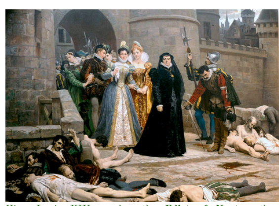
King Louis XIV revokes the Edict of Nantes , thus depriving French Protestants of all religious and civil liberties granted by Henry IV in 1598. This would lead to widespread Huguenot persecution and subsequent migration to the Carolinas.