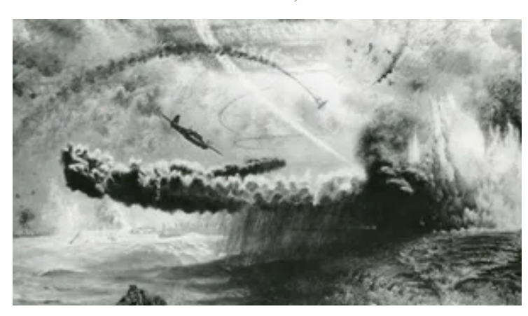
The largest naval battle in history begins in the Leyte Gulf, off the Philippine Islands. The battle involved 216 U.S. warships and 64 Japanese ships and resulted in the destruction of the Japanese Navy, including the Japanese Battleship Musashi, one of the largest ever built.