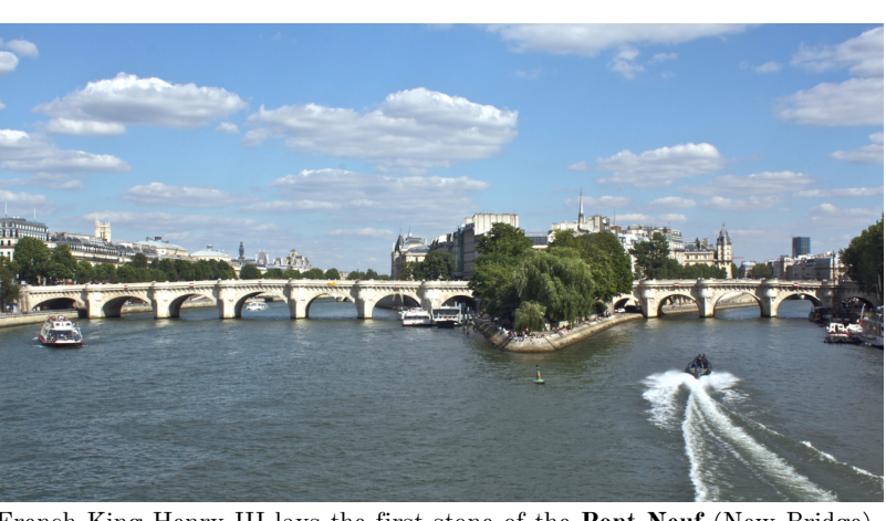
French King Henry III lays the first stone of the Pont Neuf (New Bridge), which is now, ironically enough, the oldest bridge in Paris,.