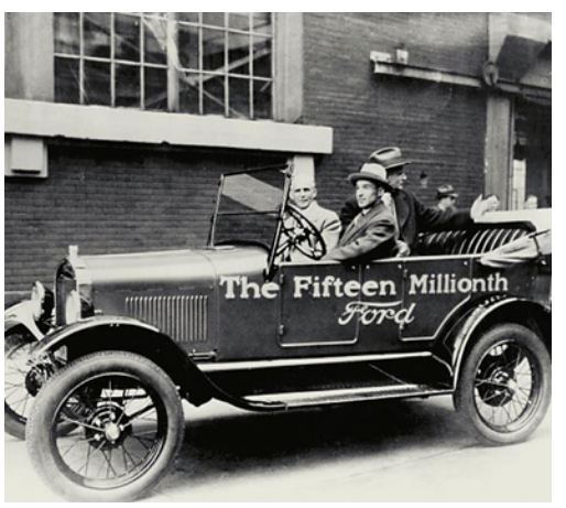
The Ford Motor Company ceases manufacture of the Model T and begins to retool to make the Model A.