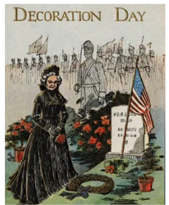
Decoration Day is first observed by the Grand Army of the Republic, the Union veterans group. In 1971, Congress standardized the holiday as "Memorial Day" and changed its observance to the last Monday in May.

Tennessee is admitted as the 16th state of the United States. June \ 1, \ 1796