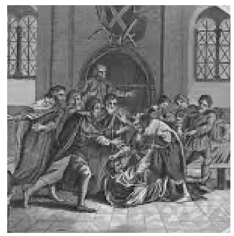
Edmund I, King of the English, is killed in a street fight in the town of Pucklechurch, Gloucestershire.